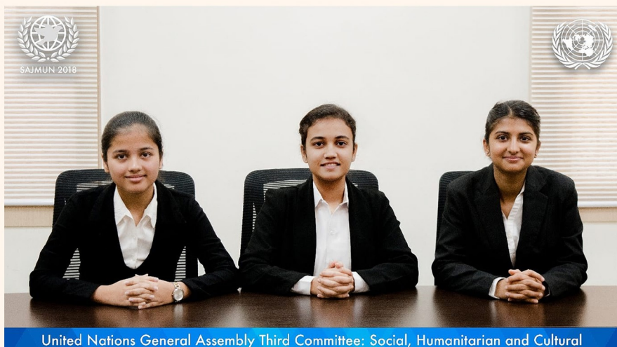
United Nations General Assembly Third Committee: Social, Humanitarian and Cultural